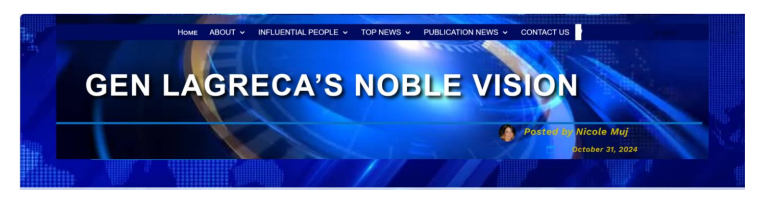
Gen LaGreca's Noble Vision

Posted by Nicole Muj | Oct 31, 2024 | Exclusive Interviews, Front Page, INFLUENTIAL PEOPLE NEWS