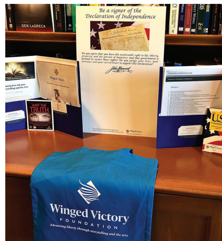
The Teacher's Kit contains materials in our reading program that are available to download for free on our website.