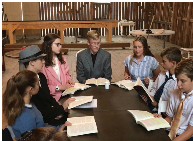
One class enacts a scene from Just the Truth .