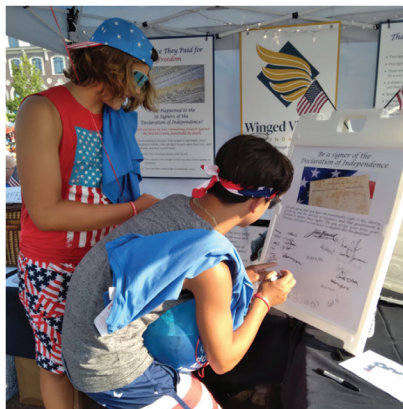
Two teens eagerly signed. They're our future leaders who take liberty seriously!