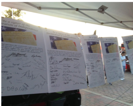
We filled 16 posters with signatures as festival-goers expressed their love of liberty and America's founding principles!

Are you organizing a patriotic group activity? Our Be a Signer posters are available for your group meetings and educational functions.