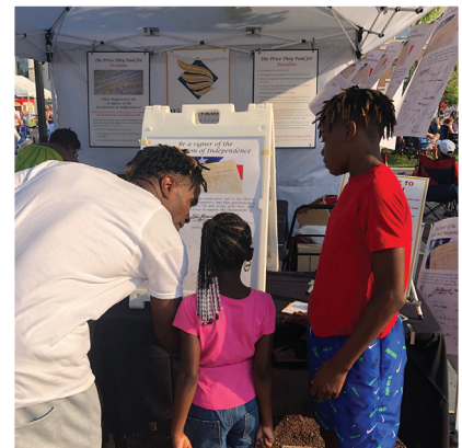
Here's a father explaining the Declaration of Independence to his children at our booth. The entire family signed.